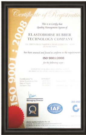
ISO 9001 - 2008